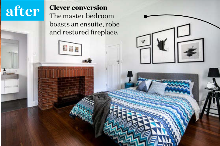
after Clever conversion The master bedroom boasts an ensuite, robe and restored fireplace.