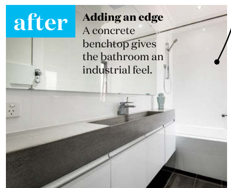
after Adding an edge A concrete benchtop gives the bathroom an industrial feel.