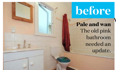
before Pale and wan The old pink bathroom needed an update.

And having lived in the cottage for a year, he's enjoying its comfy vibe. "It really feels like a home, not a sterile or clinical new house," he says. ■+