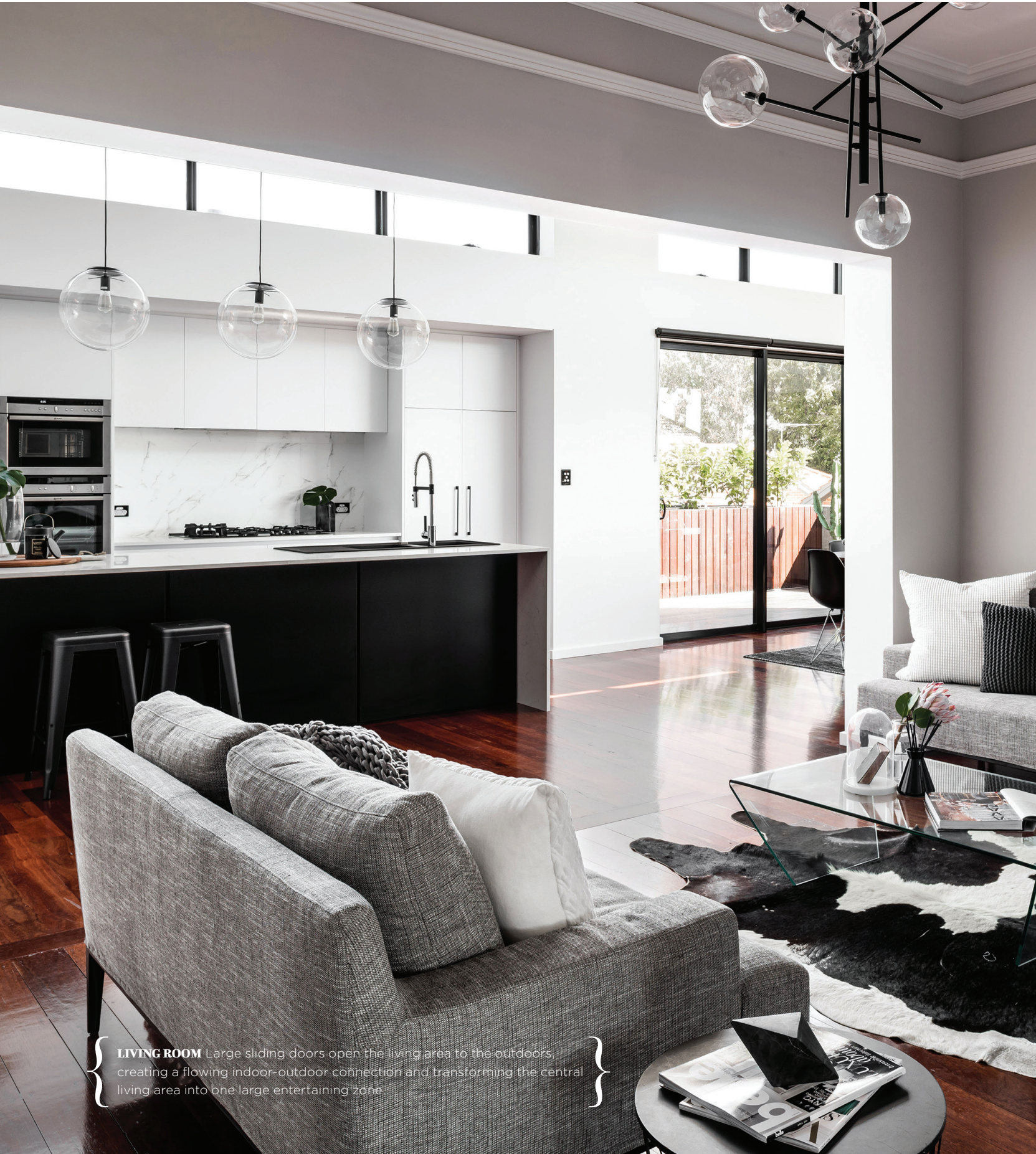
LIVING ROOM Large sliding doors open the living area to the outdoors, creating a flowing indoor-outdoor connection and transforming the central living area into one large entertaining zone.